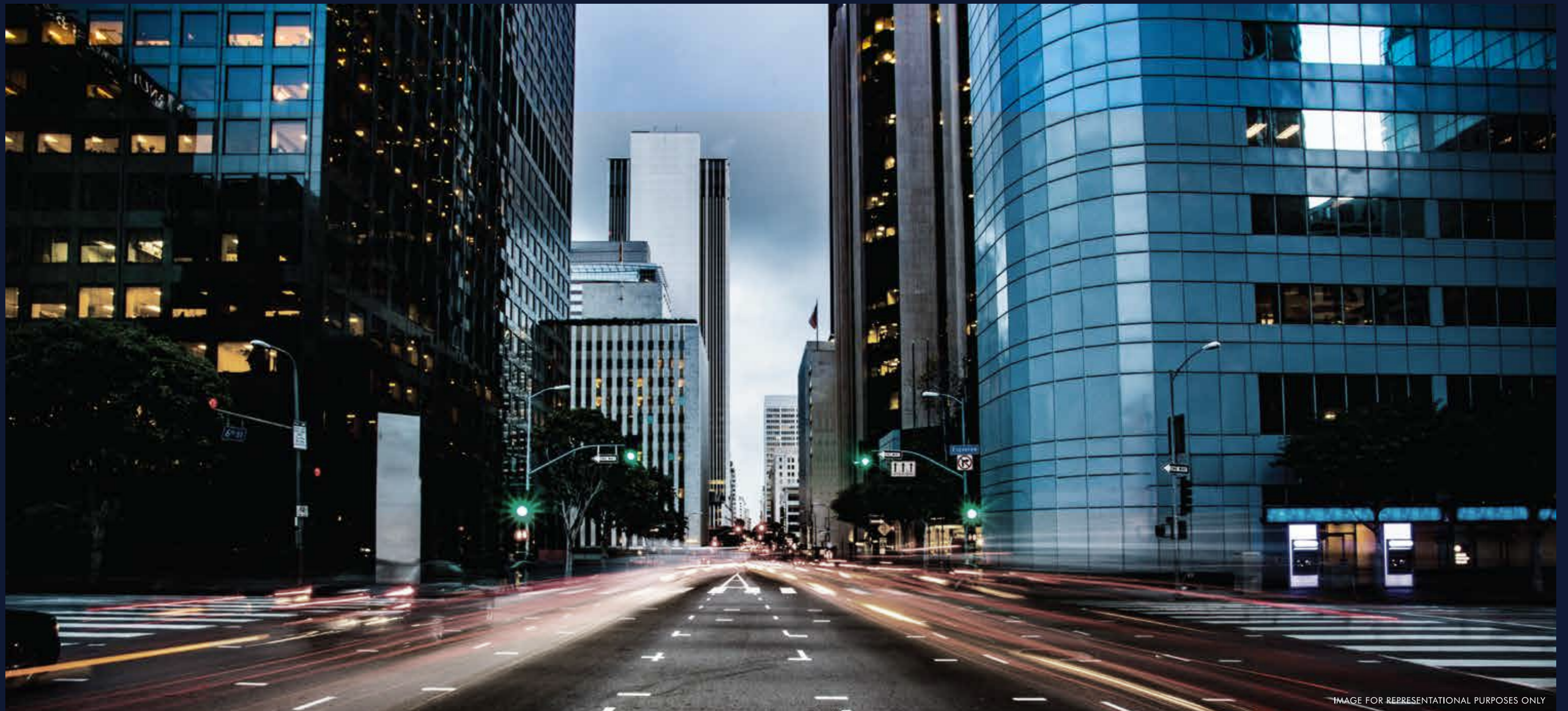
IMAGE FOR REPRESENTATIONAL PURPOSES ONLY