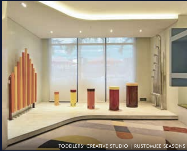
TODDLERS' CREATIVE STUDIO | RUSTOMJEE SEASONS