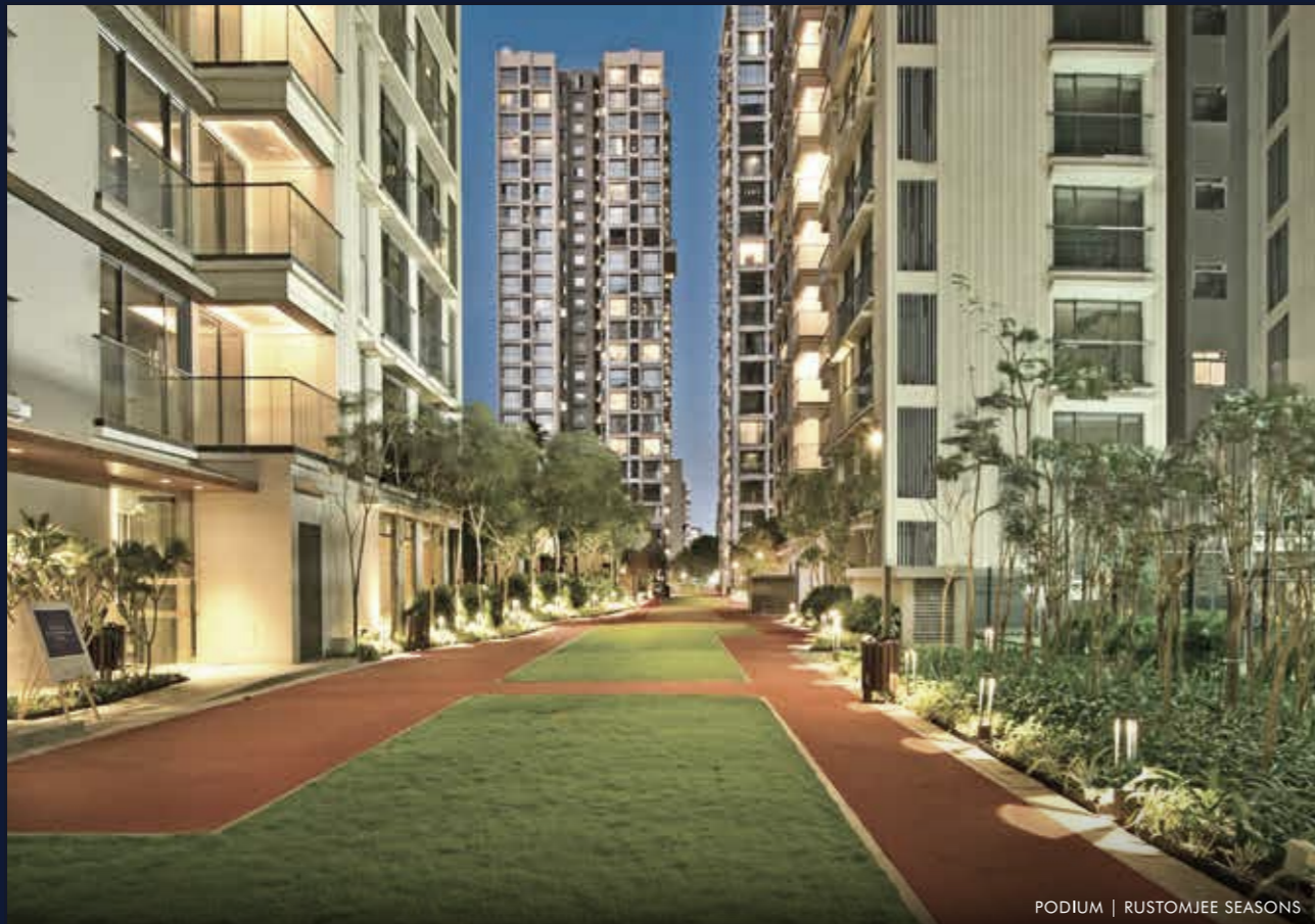
PODIUM | RUSTOMJEE SEASONS