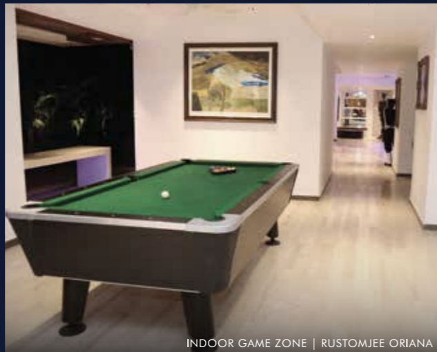
INDOOR GAME ZONE | RUSTOMJEE ORIANA