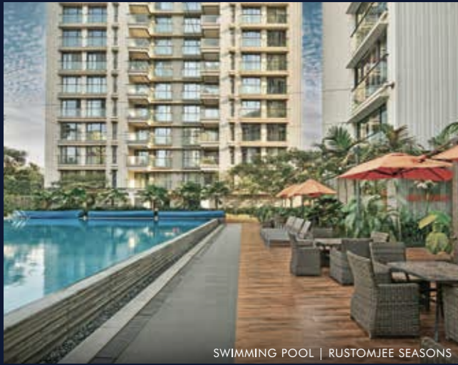
SWIMMING POOL | RUSTOMJEE SEASONS