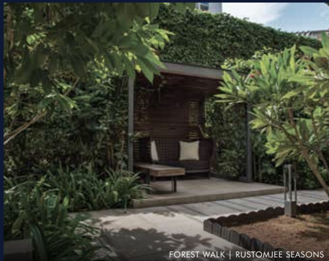
FOREST WALK | RUSTOMJEE SEASONS