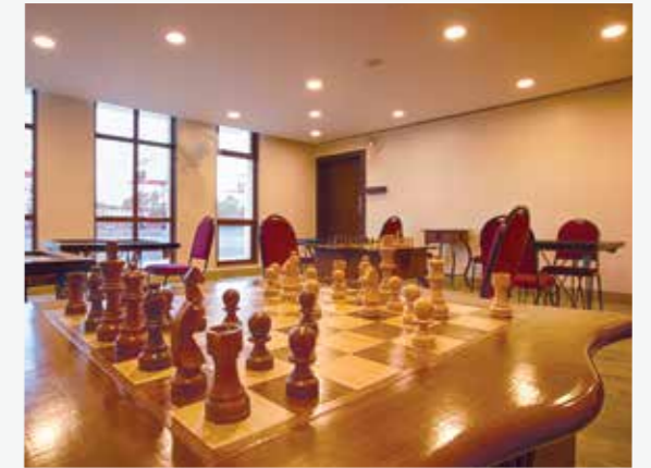
SETTLE BETS WITH FRIENDS OVER CARROM AND CHESS.