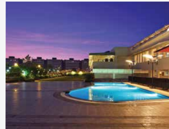
HOST A FAMILY REUNION AT THE PARTY LAWN.