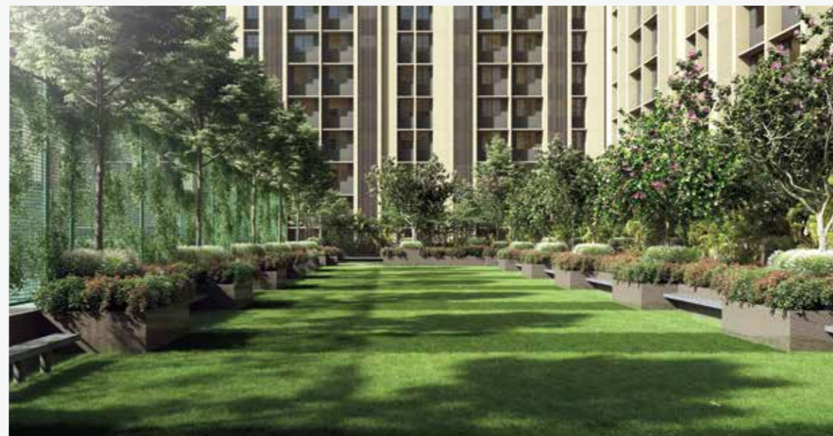
GET YOUR FILL OF FRESH AIR AT THE MULTIPURPOSE LAWN.