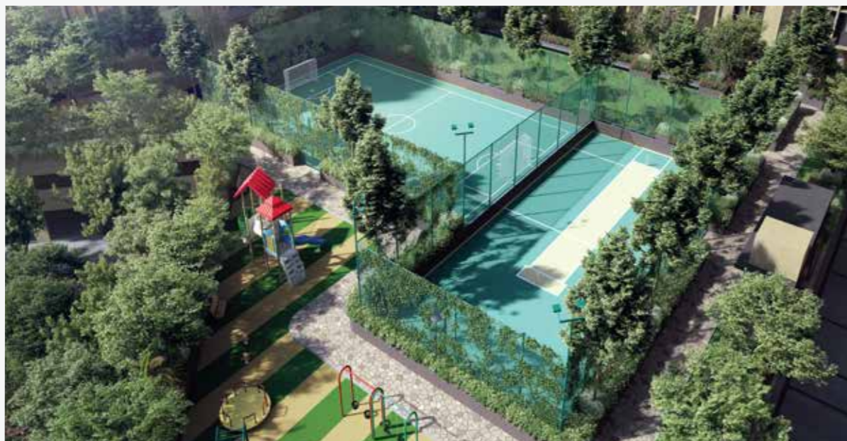
SETTLE THE FUTSAL VS BOX CRICKET DEBATE FOR THE EVENING.