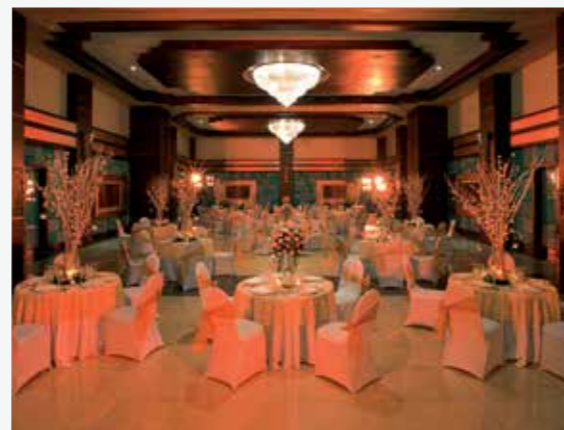
MAKE UP FOR ALL THE ANNIVERSARIES YOU FORGOT AT THE BANQUET HALL.