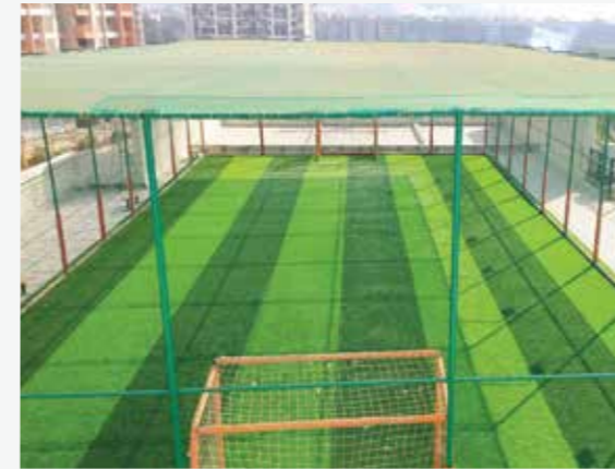
PLAN A DAD VS KIDS FOOTBALL MATCH.