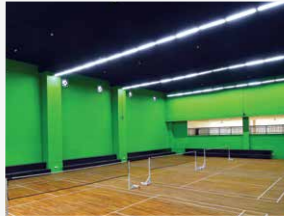
RENEW THOSE LONG FORGOTTEN NEW YEAR RESOLUTIONS AT THE BADMINTON COURT.