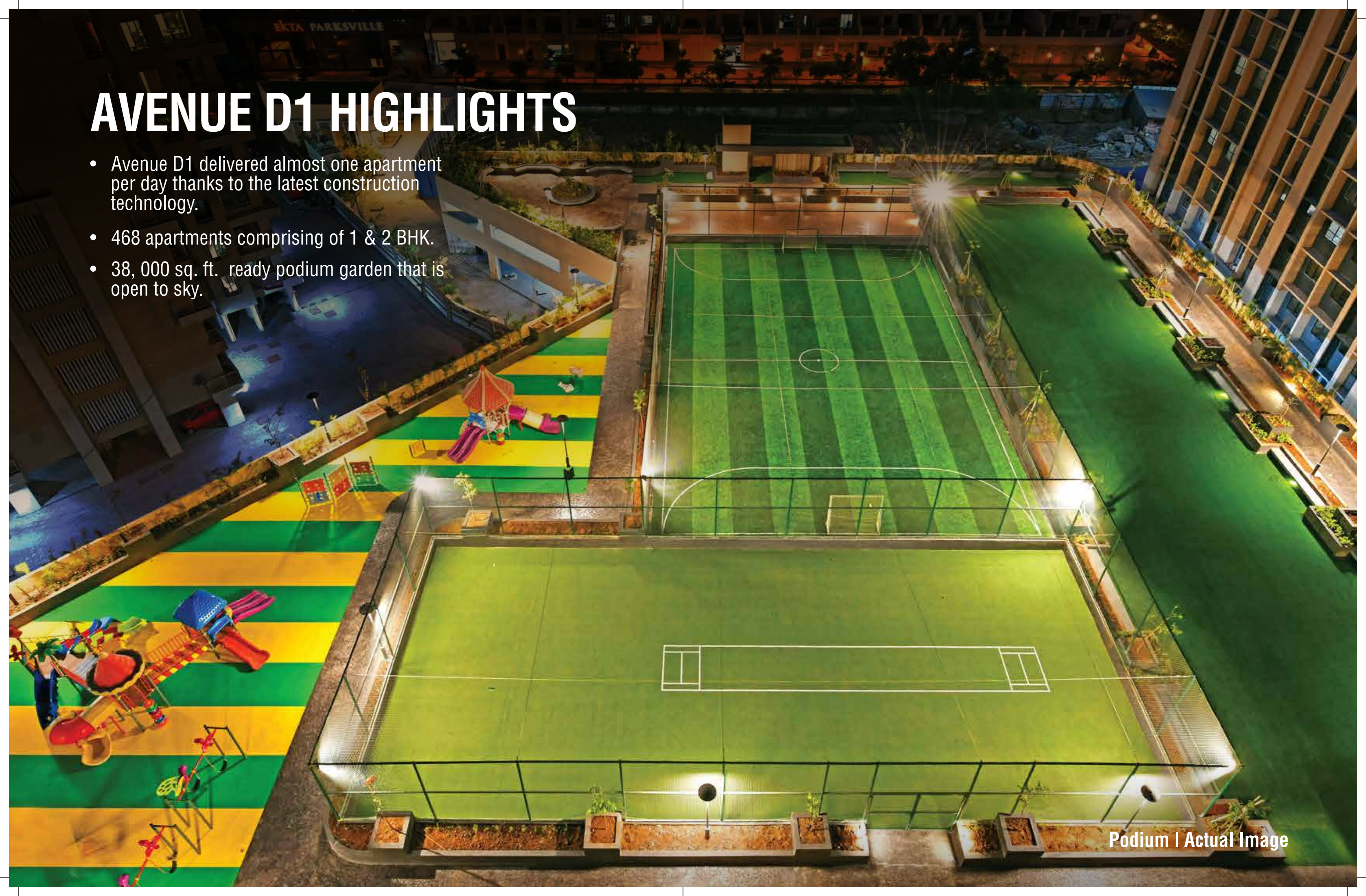
Podium | Actual Image