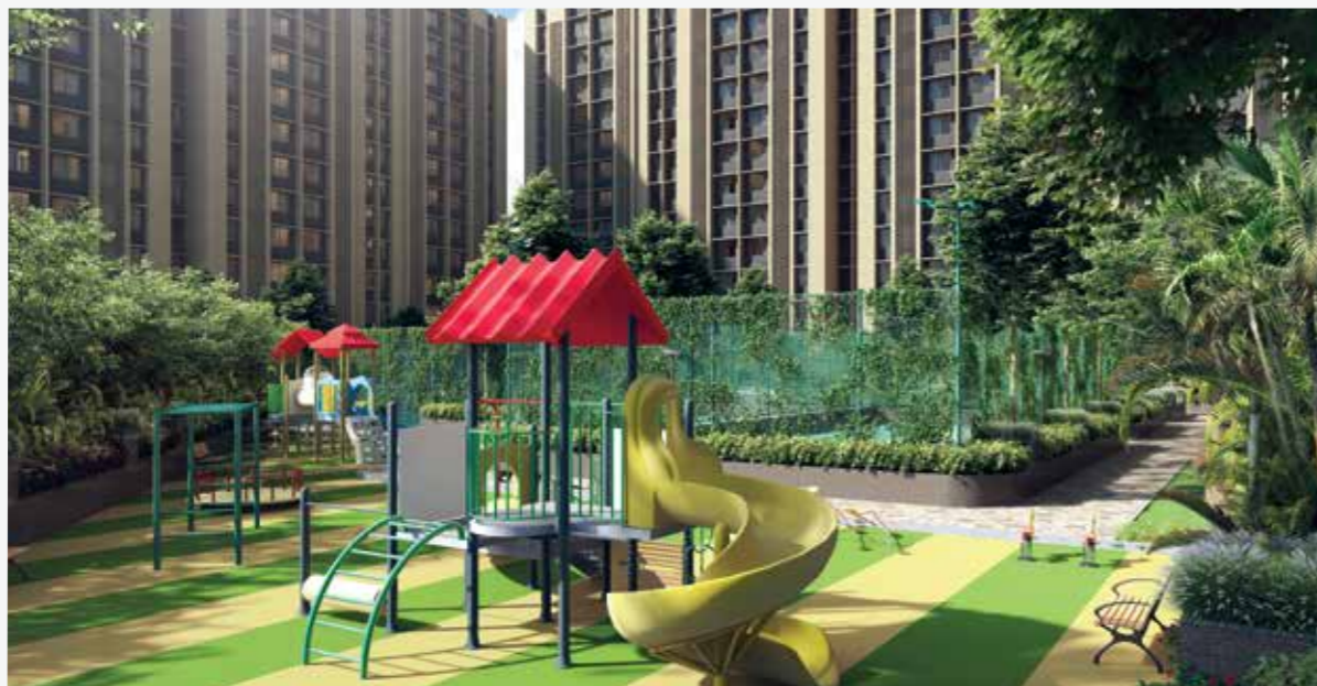
ENTRUST BABY SITTING DUTIES TO THE SLIDES AND SWINGS AT THE CHILDREN'S PLAY AREA.