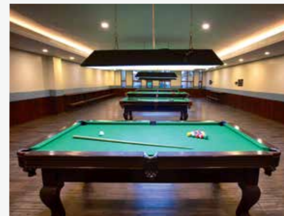
SPEND YOUR EVENINGS HERE AT THE POOL TABLE - ALSO KNOWN AS, THE REAL SOCIAL NETWORK.