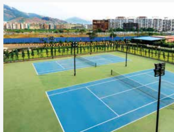
SCORE MAJOR POINTS WITH YOUR BOSS OVER A GAME OF TENNIS.