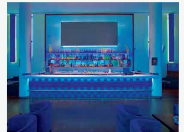
INVITE THE WORK GANG OVER FOR HAPPY HOURS AT THE BAR.