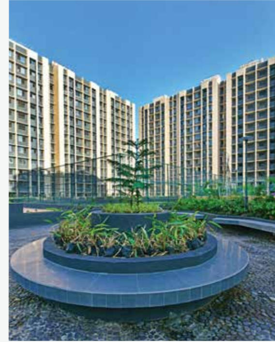
SENIOR CITIZENS' AREA