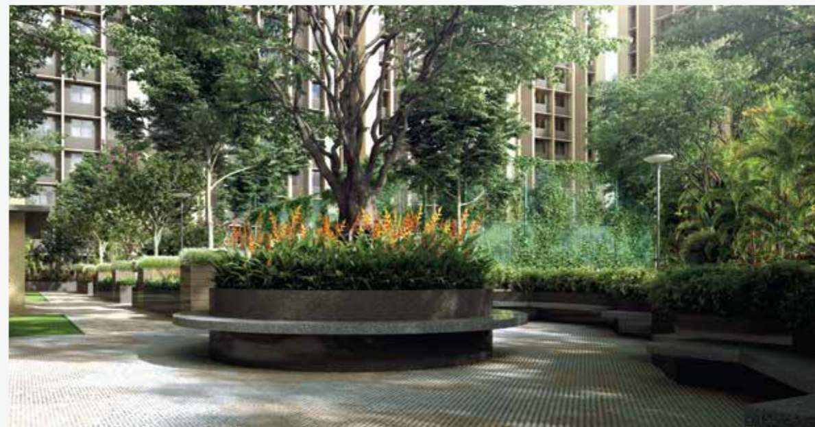
HEAD OVER TO THE SENIOR CITIZENS' PLAZA TO DISCUSS LIFE, THE UNIVERSE AND THE MERITS OF CUTTING CHAI.