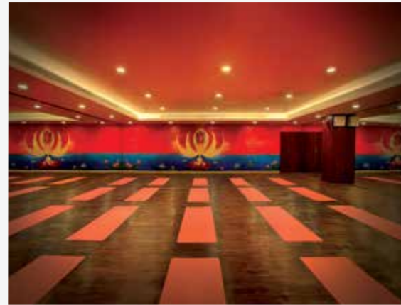
INCH CLOSER TO INNER PEACE AT THE YOGA AND MEDITATION STUDIO.