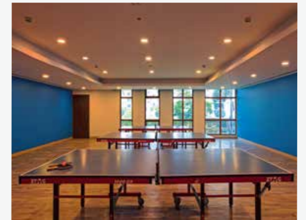
RELIVE THOSE COLLEGE RIVALRIES OVER ENDLESS TABLE TENNIS MATCHES.