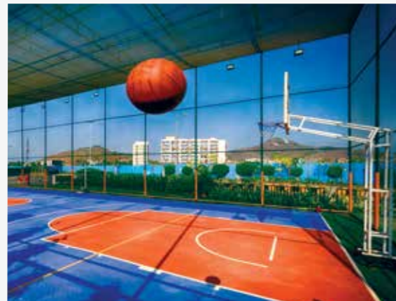
CHANNEL YOUR INNER MICHAEL JORDAN AT THE BASKETBALL COURT.